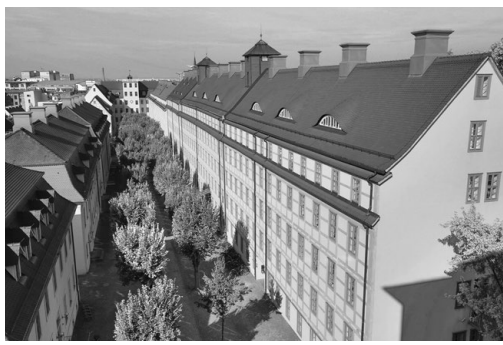
Guest rooms are available in the historic Long House